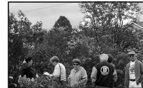
CPPC Members check out Lilac Gardens