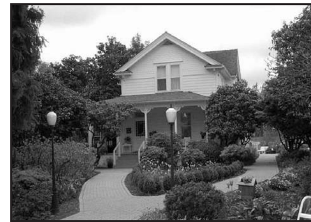
Hulda Klager's House built in 1889; Woodland, WA

scenic road to the Ridgefield Wildlife Refuge where members drove through some of the 5,150 acres of habitat for birds migrating through the region west of the Cascade Mountains in the Pacific Flyway.