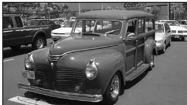
Yes that is a 1941 Plymouth Woodie Wagon, in Hawaii??