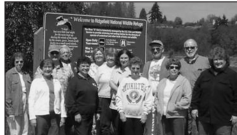
CPPC members at the Wildlife Refuge: