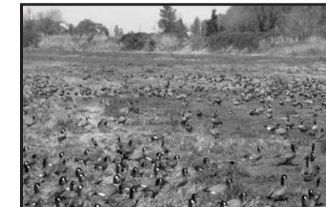
Hundreds of Canadian geese, swans and other birds at the Ridgefield Wildlife Refuge