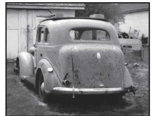
The 1936 Plymouth 4-Dr. Sedan is surprizing complete dispite appearances.